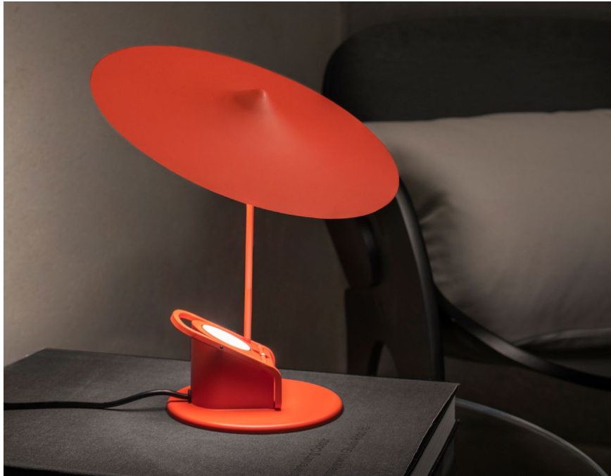
Product (left): w153 Île Designer: Inga Sempé

With w153 Île, Inga Sempé revisits the simple yet clever clamp lamps of her childhood, upgrading their status while adding stability, personality, and multi-functionality.