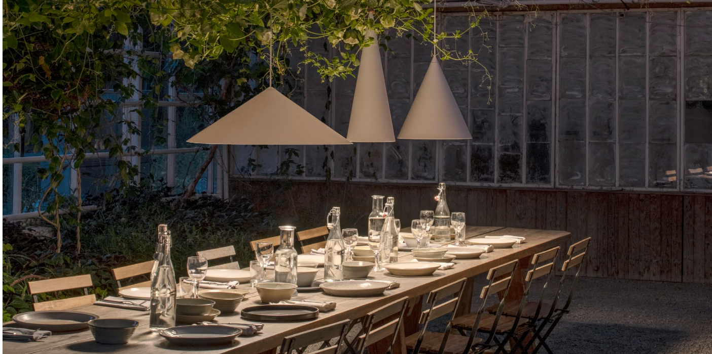
Product (left): w221 Medium Pendant Designer: Claesson Koivisto Rune

Whether suspended above a dining area or a conference table, its perfectly balanced presence echoes the lightness and precision seen in its siblings, w151 Extra large pendant and w201 Extra small pendant. Carefully and expertly illuminating any space it finds itself in, w221 Medium pendant can be trusted to create a welcoming atmosphere and a heightened spatial experience.